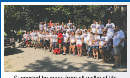
Supported by many from all walks of life