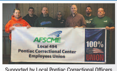
Supported by Local Pontiac Correctional Officers